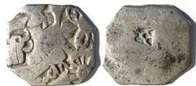
Silver punch mark coin of the Mauryan empire , with symbols of wheel and elephant. 3rd century BCE.