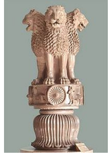
This is the famous original sandstone sculpted Lion Capital of Ashoka preserved at Sarnath Museum which was originally erected around 250 BCE atop an Ashoka Pillar at Sarnath.